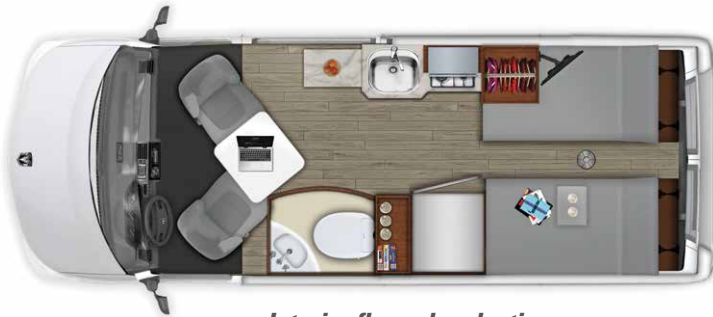
Interior floor plan daytime.