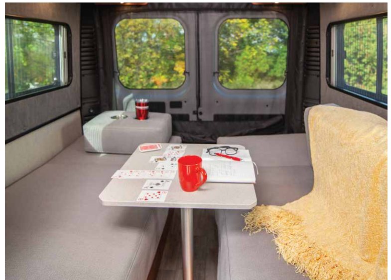
Rear lounge and twin bed area offers a great place to relax, work or dine.