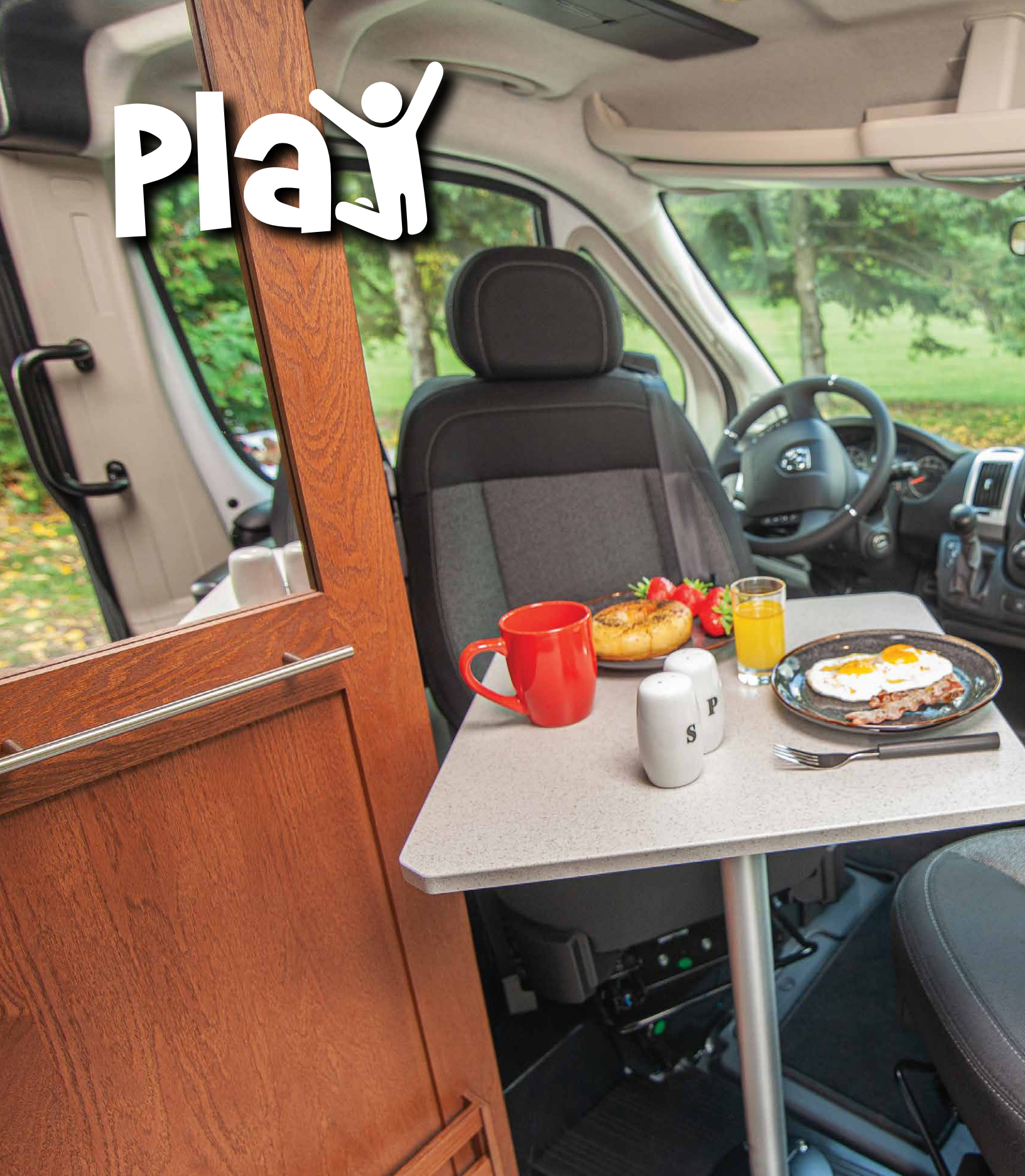
Spacious front dining area comfortably seats two.