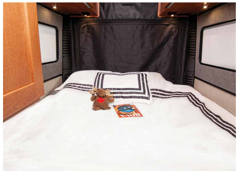
Rear lounge area easily transforms into a sleeping area with a comfortable king size bed.