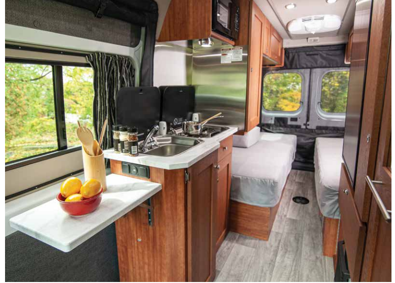
Open aisle floor plan allows for flexibility in sleeping accommodations and storage of large items.