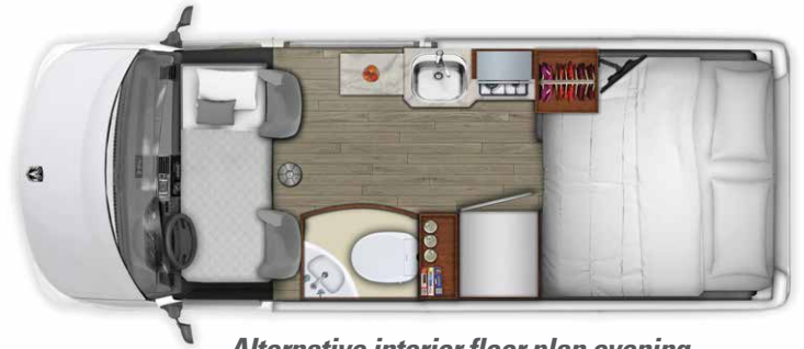
Alternative interior floor plan evening. (Shown with optional front folding mattress.)