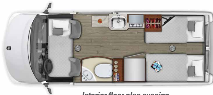
Interior floor plan evening. (Shown with optional front folding mattress.)